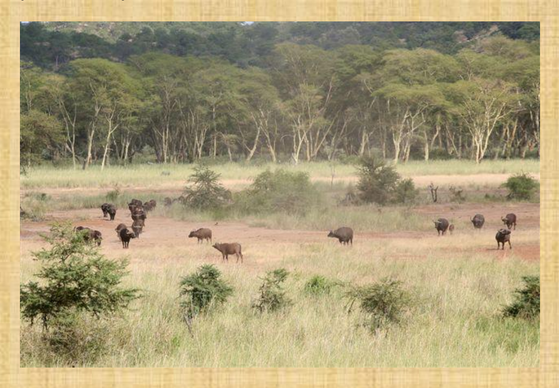
Part of the buffaloherd emerging from the Fever Forest and grassland at Hlangahluwe, moving to the pan. The photo was taken from the northern slopes of the kopje.

slopes again and then along the ridge to the northern edge to view the full extent of the herd.