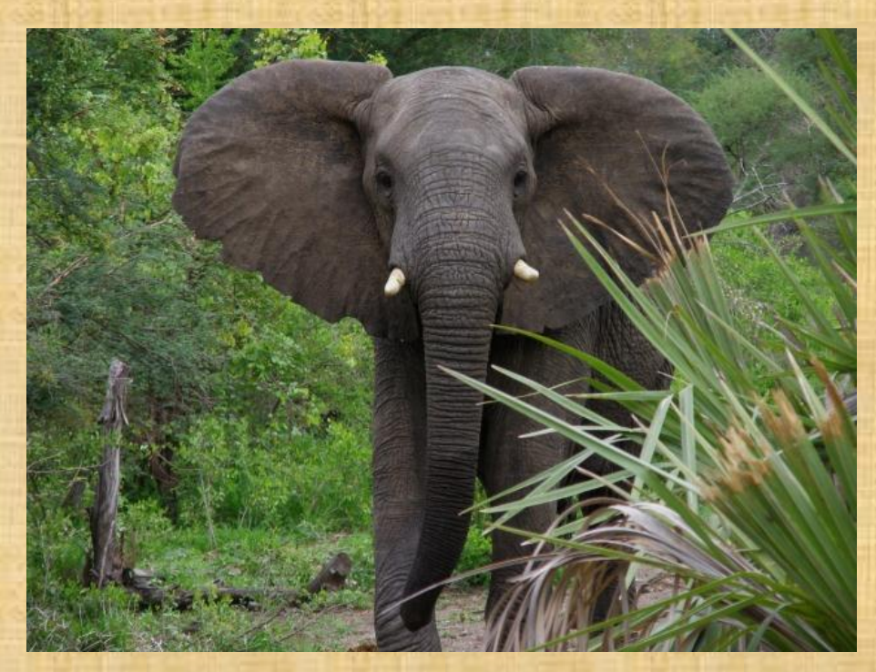
Enough to get the adrenaline flowing!!

This conversation was still going on when Willem looking up the path ahead, as all good back-ups should when the lead is engaged in interpretation with guests, urgently hissed "Elephant"!!! The big bull was ambling towards us but we wasted no time in gaining the safety of the higher ground of the small kopje about halfway up.