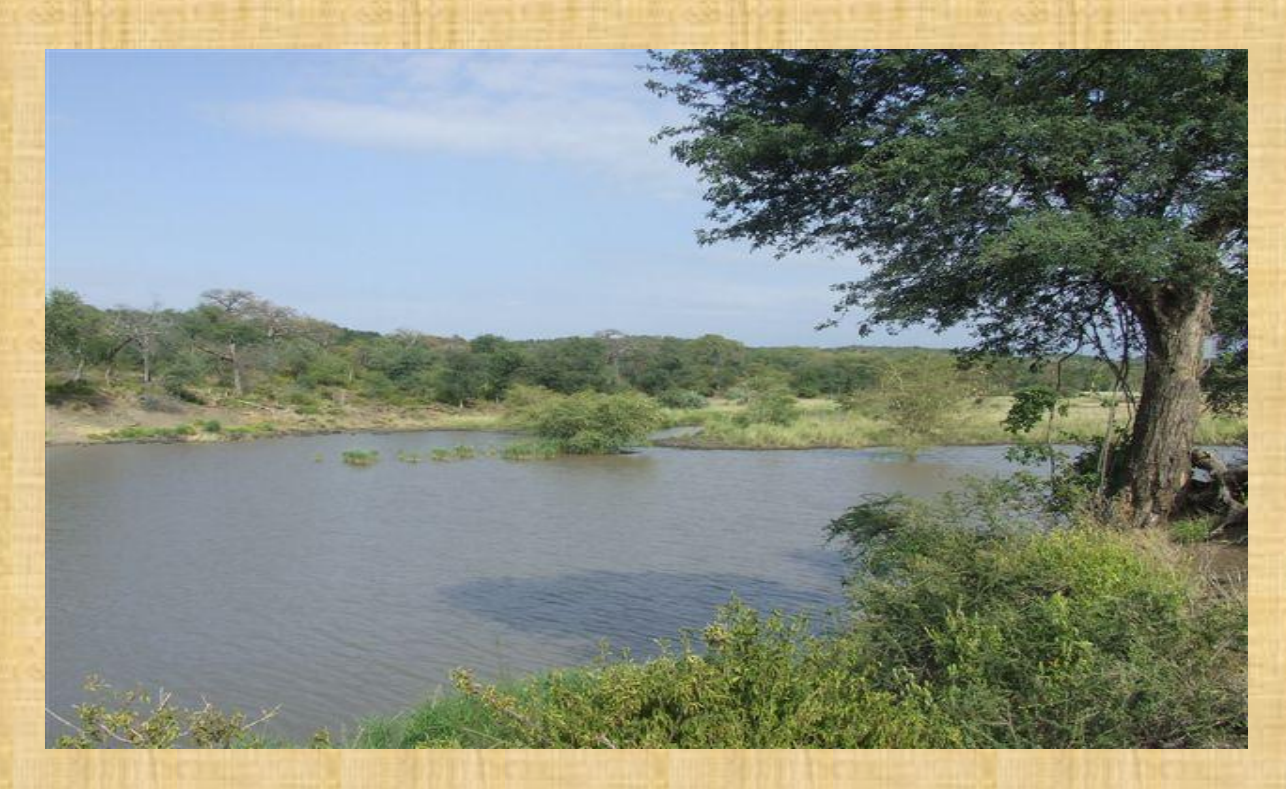
Hlangahluwe Pan viewed from the Kopje. Our initial approach was from behind the tree line on the opposite bank.

With time moving on, I wanted to get around the kopje to see what was in the flood plain to the south of us. Walking up the kopje to gain more height, the Limpopo Floodplain was breathtaking in the early morning sunlight. It was, however, quiet, and moving down the kopje slopes with the intention of re-crossing the flood plain back to the vehicle to have tea/coffee at the Limpopo River at Mangeba Look-Out, we re-traced our steps back onto the wide elephant path along the bank of the pan.