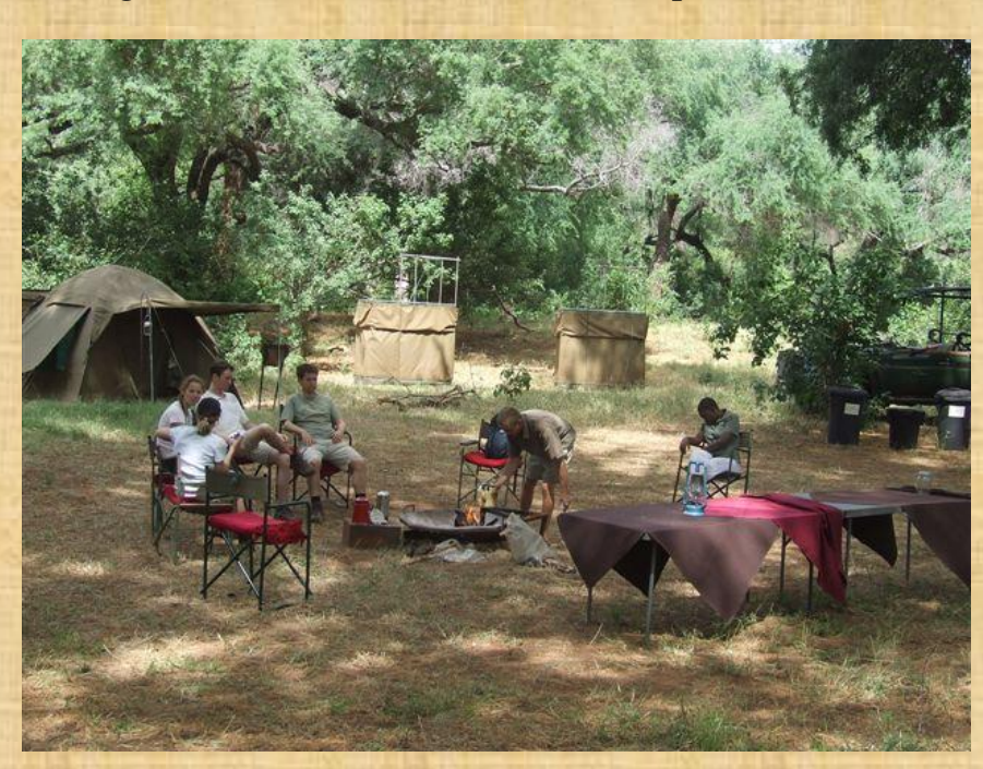
Coffee on the go at the camp on The Pafuri Walking Trail.

The highlight of the year thus far has to be the introduction of The Pafuri Walking Trail into our portfolio. This very rustic tented camp provides the guest with an extremely wild Big 5 experience in a great setting on the Luvuvhu River Floodplain.