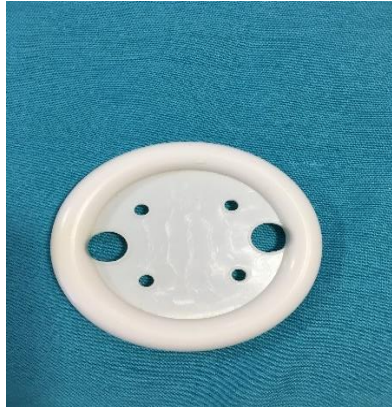
Picture of a ring pessary with support

Use of vaginal pessaries are usually offered as first-line treatment. These devices are made of silicon and there are many types of vaginal pessaries. The most commonly used pessary globally is the ring pessary. See picture below.